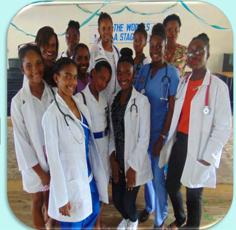
Junior High School